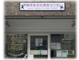
※See page 3 for more info and QR code.

【Address】 Ueno Higashi-machi 2955, Iga City